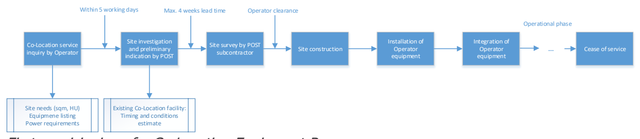
First provisioning of a Co-Location Equipment Room

The fundamentals of the provisioning process are described below: