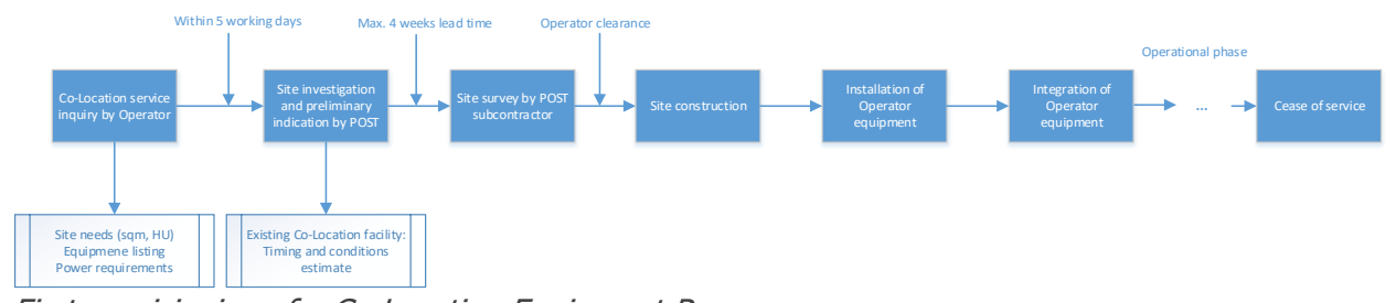
First provisioning of a Co-Location Equipment Room

The fundamentals of the provisioning process are described below: